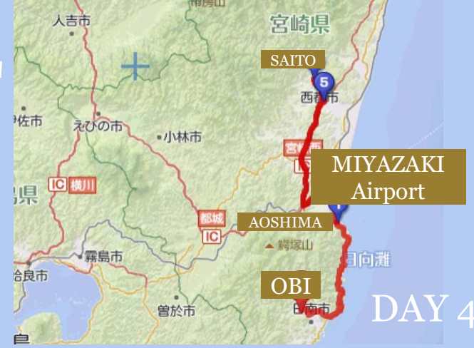
OBI⇒AOSHIMA⇒SAITO ⇒MIYAZAKI Airport