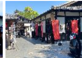
Josaien in Sakuranobaba