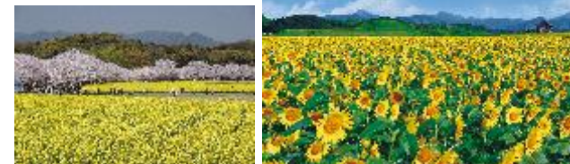
Saitobaru Burial Mounds