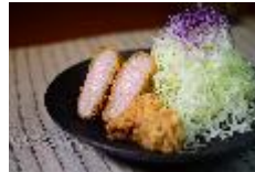
Black pork tonkatsu

For lunch, enjoy the Kagoshima specialty of tonkatsu made with pork from the region's black pigs.