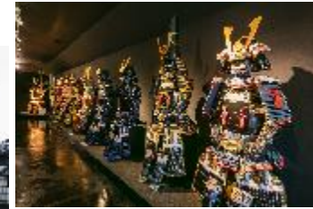
Traditional armour and weapons