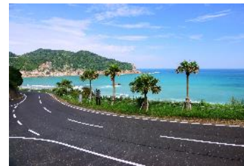
Nichinan Kaigan Quasi-National Park