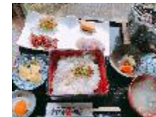
Katsuo aburi ju

For lunch, enjoy the local specialty of katsuo aburi ju, which consists of fresh broiled bonito marinated in two kinds of sauce and served on rice.