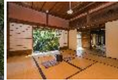
Izumi-Fumoto Samurai Residences