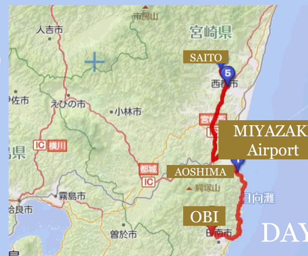
OBI⇒AOSHIMA⇒SAITO ⇒MIYAZAKI Airport