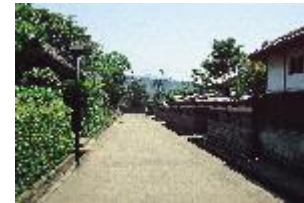
Obi Castle Town

Accommodation for the evening is at the hot spring inn Nazuna Obi, a renovated 140-year-old samurai house that was built as the residence of a doctor working for the Obi clan at the end of the Edo era. All five of Nazuna Obi's Kogakura guestrooms are equipped with open-air hot spring baths. There are also two individual houses, Katsume and Aiya, that are available as single-property accommodations. For dinner, enjoy original Japanese cuisine that makes abundant use of local specialties.