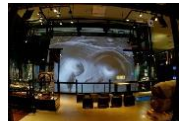
Saitobaru Archaeological Museum